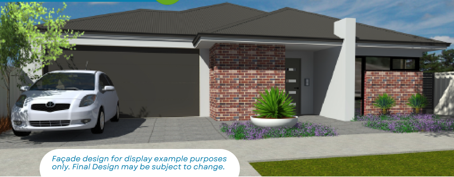
Façade design for display example purposes only. Final Design may be subject to change.